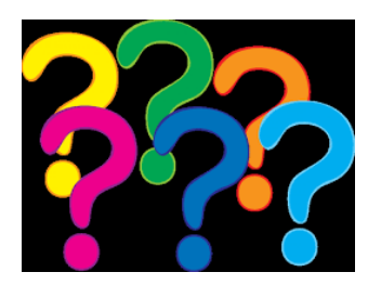
Last issue's quiz

1. How many clergy are there in the Sudbury Deanery? Answer: 19 - how many did you count? This is one for each parish in the Deanery - though it has to be admitted that the number includes those who are retired! We thank them all for their service and ministry among us.